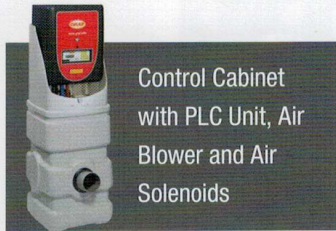
Control Cabinet with PLC Unit, Air Blower and Air Solenoids