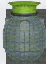
Pump chamber for disinfection and transfer to irrigation.